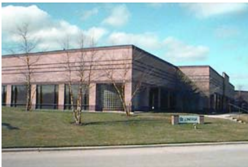
FOURTEEN FORTUNE PARK

Meridian commenced renewal discussions with the landlord 2 years in advance of the lease expiration. The major challenge was to motivate the landlord to do a “below-market” renewal 2 years early. The landlord’s initial position and proposal indicated they were not motivated to renew Lantech 2 years early, unless they received an increase in the rental rate. If not, the landlord wanted to wait and see what the market would bear in 2 years. Meridian used its unequalled market knowledge to negotiate virtually no rental increase from Lantech’s current lease and almost $150,000 in allowances. Lantech never risked having to entertain a costly relocation and maintained its current rental rate for an additional 5 years.