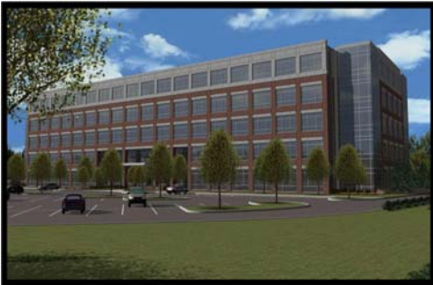
HAMILTON CROSSING VI